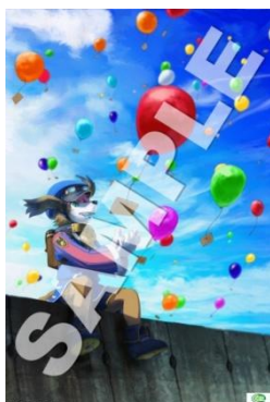
Miibou (YUKE'S CO., Ltd.)