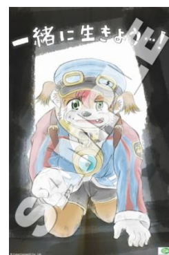
Niisan