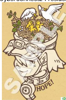
Daisuke WAKASUGI Contribution