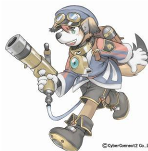
Mamoru-kun, the mascot character of Fukuoka prefecture's disaster preparation program.

FUKUOKA, Japan., 3 rd October, 2012 - CyberConnect2 Co., Ltd., a Japanese video game developer based in Fukuoka, Japan, today announced its fifth release of illustrations and smartphone wallpapers contributed to "Mamoru-kun Reconstruction Support Project" (Japanese: まもるくん 復興支援プロジェクト), a charity project aiming to support people in the 3.11 disaster area. The latest update includes new illustrations and smartphone wallpapers.