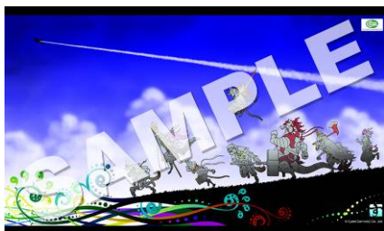
Atsuhiko SATO & Akira OHKUBO (collaboration)

Available sizes: A4 size, iPhone wallpaper size, and Android Wallpaper size.